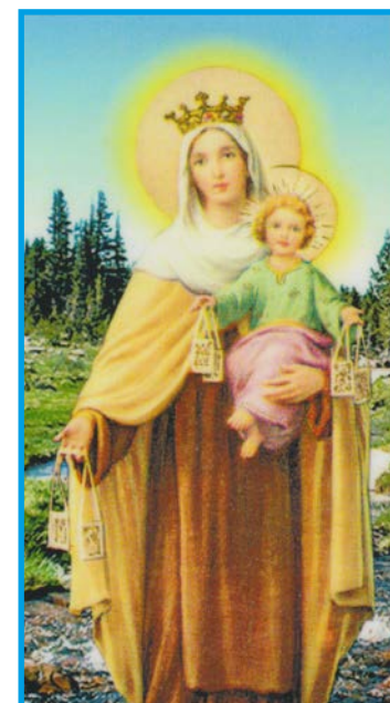
Our Lady of Mount Carmel, Pray For Us