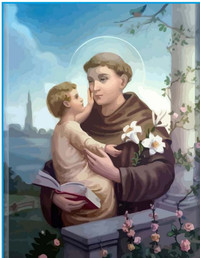
St. Anthony, Pray For Us